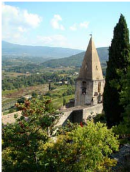
A view from a hilltop town toward Mt Ventoux

The exhibit will hang from May 1 to June 1, 2010, open during library hours.