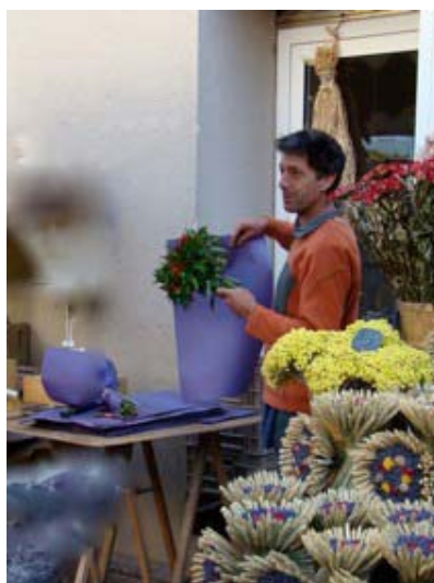
A flower vendor at the Sunday market, Isle sur la Sorgue