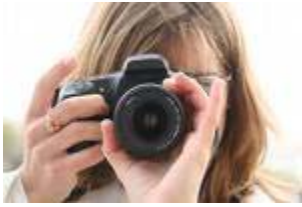
Photo Show a Success