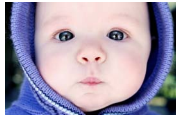
People’s Choice Award

We would like to convey our appreciation to the sponsors who contributed to make the contest a success and to Artfully Framed at the Lake, who displayed the winning photos for the month of June following the contest.