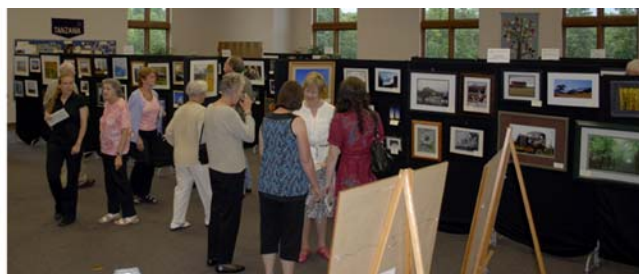
2011 Photo Show