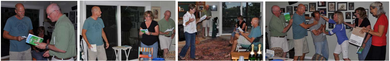
The actors and director are working hard to bring you a fun and entertaining evening – Don't Miss It!

The cost will be $10 per person due to the costs incurred to produce the show.