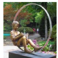
Friend for Life