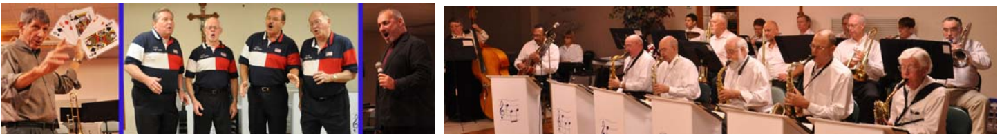
SMAC Annual Meeting and Arts Expo

Share SMAC's slogan with your friends and neighbors. "If you aren't a member of SMAC... you should be."