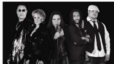
Pitches Be Crazy