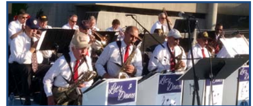
D Day Memorial Patriotic Concert

Other events and band information can be seen at our website www.theletsdanceband.com .