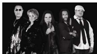
Pitches Be Crazy