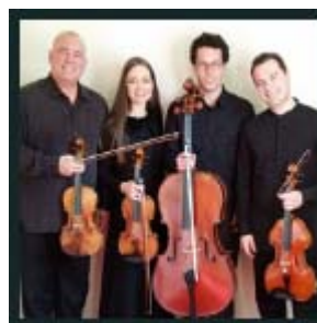
James String Quartet

Purchase tickets thru www.lynchburgtickets.com