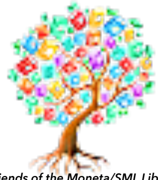
The Friends of the Moneta/SML Library

The Let's Dance Band is comprised of professional musicians ages 17 – 93. The group's repertoire consists of popular music from the 1930s to now including Big Band Swing, Jazz, Latin, Funk, and Rock.