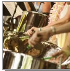
SML Steel Drum and Marimba Band

Bower Center for the Arts embodies the belief that the arts hold transformative potential. Article on page 5. www.bowercenter.org .